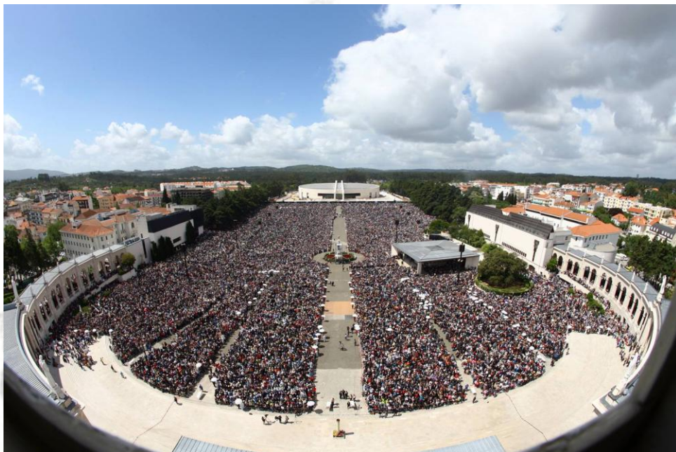
Fátima, Overview (May 13, 2015)

The image of John Paul II was present in all meetings, not only because he was a great personality who contributed greatly to bridging the gaps between the different religions, but also because he had a strong connection to Fátima (Our Lady of Fátima), which he visited three times. Besides that, John Paul II has always believed he survived the attempt against his life on 13 th May 1981, in Vatican, due to his devotion to Our Lady of Fátima. In 2000, Pope John Paul II had a major role in the beatification of the little shepherds Francisco and Jacinta. Since then, the city of Fátima has developed a lot and its Sanctuary is one of the most visited places in our country.