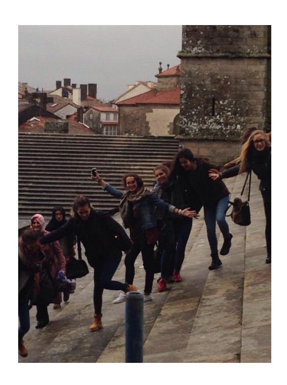
That afternoon in Santiago was devoted to visit our main historical and artistic monument: the Cathedral.

From the rooftops and from inside, the view is breathtaking and spectacular, especially when you have the opportunity to see the "Botafumeiro" swinging back and forth of the main altar and the place is filled with an incense odour.