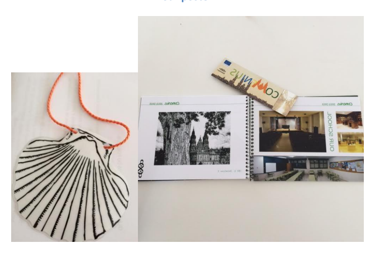
our badge, bookmarker and agenda